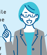
A staff of Nagaoka University of Technology Library

It was my job that got me started, but I keep doing it in a relaxing and long-term way. The bar is low for reading English at work now. By reading children's books in English, chatting about books on social networking sites, and reading popular articles in English sites, I can and will enjoy in a variety of ways. Some continue at their own pace, while others take a long break and then come back. Feel free to pick up one.